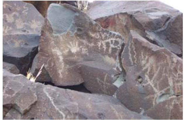
Rodman Mountain Petroglyphs

TOOLS - Collecting bags and boxes, digging tools, rock hammer, eye gear, spray water bottle, etc., Be sure to bring your camp chair to sit in at night