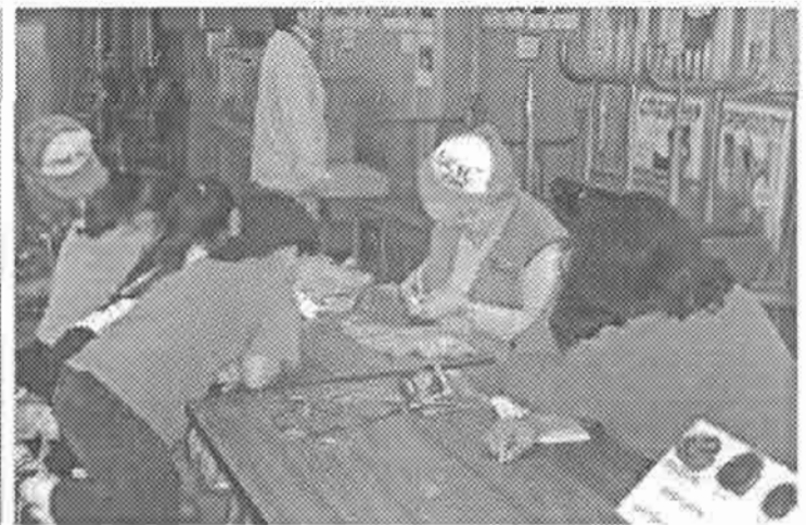
Mounting cabs to make a necklace or key chain.