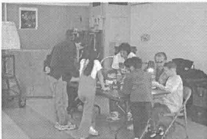
Forming and polishing cabs.